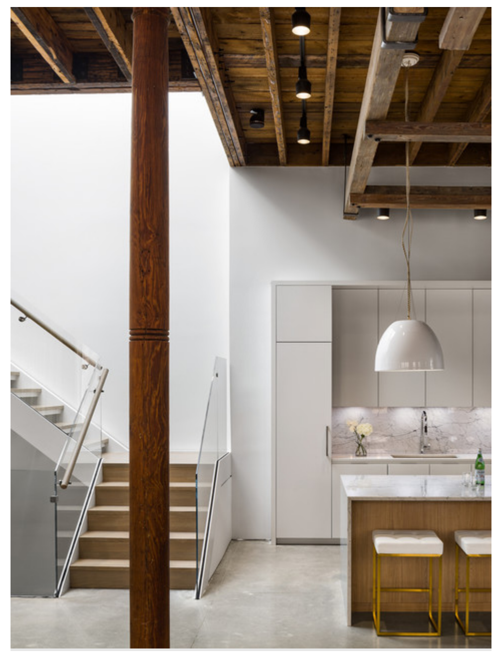
The island is a large statement piece that provides a transition between the kitchen and the dining area. "The marble waterfall counter gives it a furniture

The area under the window was made for hard work. It's a zone that's out of the cook's way and out of view from most of the other spaces. This area has a microwave, a coffee machine and a second dishwasher. "This is a good spot for them to stack the dirty dishes when they are entertaining, because it's not within view of the dining room," Ilin says. The translucent window treatments allow the light in while providing privacy. And they don't distract from the restored historic facade when viewed from the street.